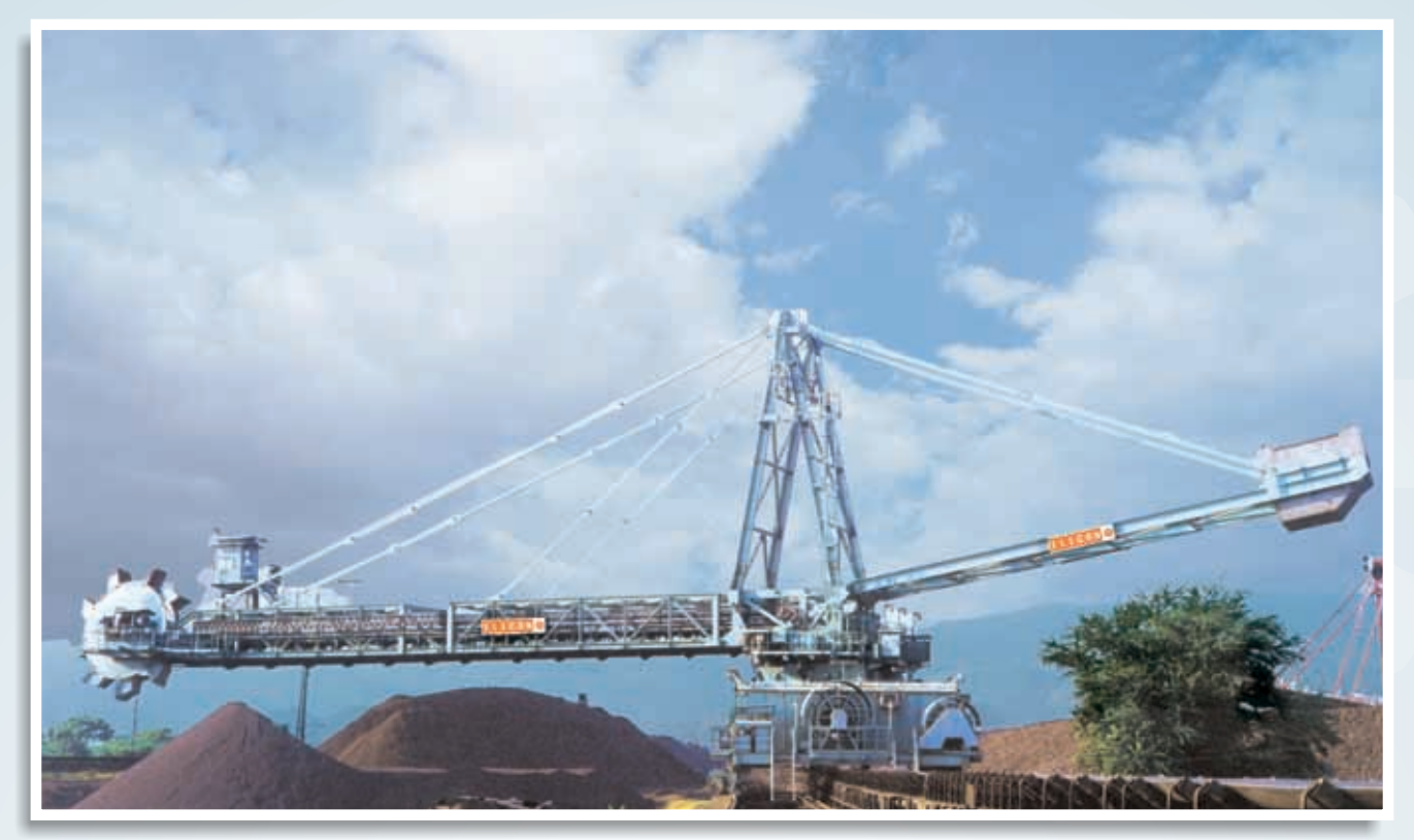
Wheel on Boom Reclaimer with 40 meters Boom Length handling Iron ore at 4000 MTPH capacity at izag Port Trust

For continuous stacking an reclaiming of crushed bulk materials, economics solutions can only be achieved by the use of combined bucket wheel stacker reclaimer. Elecon bucket wheel stacker reclaimer machine can stack the material to form the stockpile or reclaim the stockpiled material and feed onto the main line conveyor.